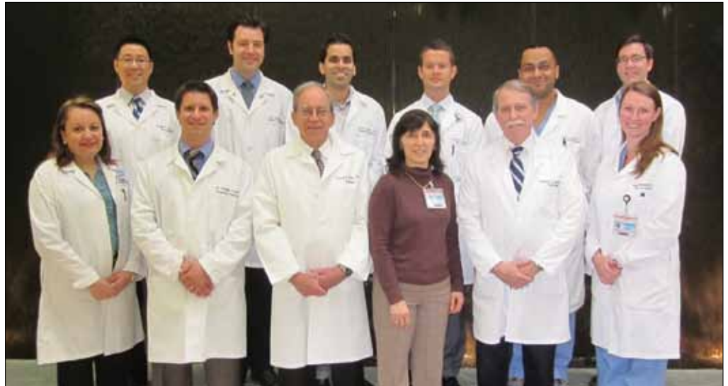
Northern Virginia Radiology Consultants, PLLC